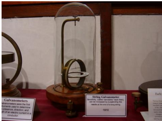
Fig. 1. An antique string galvanometer

current in the other direction will produce a counter-clockwise torque. In electromagnetic movements, there will be a “full-scale current” ( I_F ) necessary to rotate the needle so that it points to the exact end of the indicating scale. The task of the meter design is to take a given meter movement and design the necessary external circuitry for full-scale indication at some specified amount of voltage or current. By making the sensitive meter movement part of a voltage or current divider circuit, the movement’s useful measurement range may be extended to measure far greater levels than what could be indicated by the movement alone. Precise resistors are used to create the divider circuits necessary to divide voltage or current appropriately. In this lab, you are going to use D’Arsonval meter and resistors to design the divider circuits, the ammeter, voltmeter, and ohmmeter, and to test their accuracy.